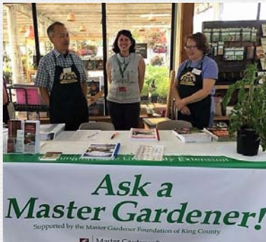
Master Gardener Clinic at Molbak's