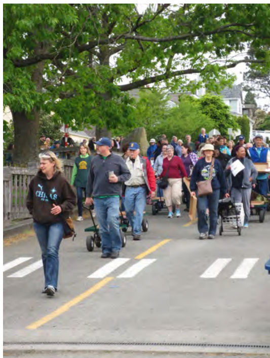
A Race to the Tomatoes is On!