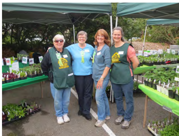
The Veggie Queens!