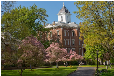
Linfield College, McMinnville

https://extension.wsu.edu/king/gardening/become-a-master-gardener/ . The deadline for submitting applications is October 15. Do you know someone who would love to apply?