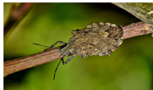
Brown Marmorated Stink Bug