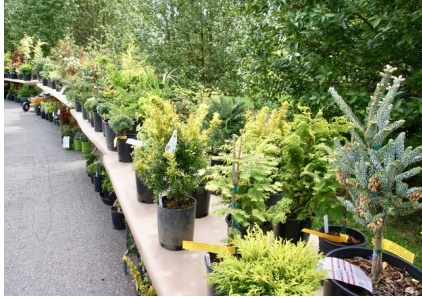
Plant Selection at the CUH Sale