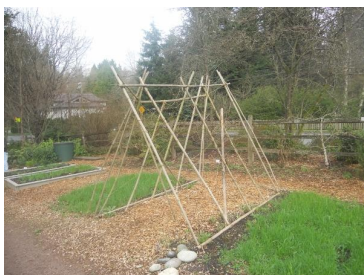
Animal Acres in March 2013