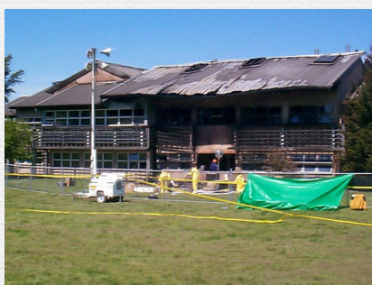
Aftermath of the May 21 fire