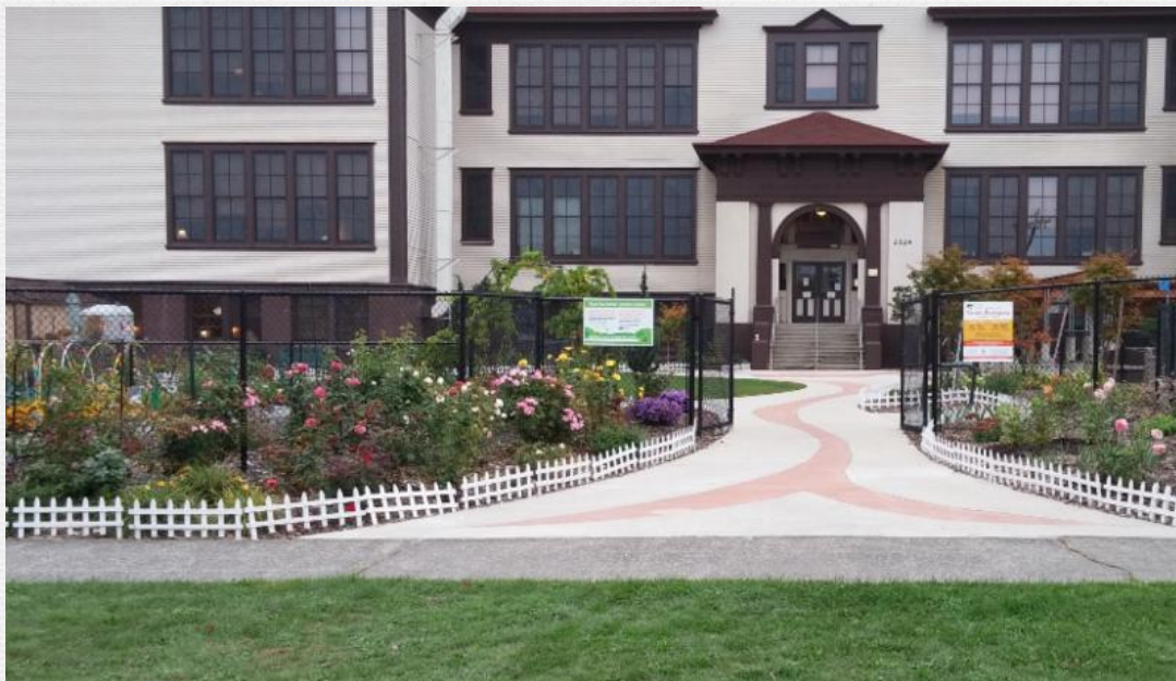
The entrance to El Centro de la Raza

The Cesar Chavez Demonstration Garden on the property of El Centro de la Raza is truly a garden para la raza . The garden's variety of plants reflects the diversity of cultures in the Beacon Hill neighborhood.